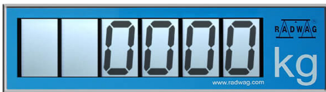
WWG 2/2 - stainless steel housing