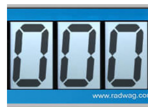
WWG 2/2 - 6 digits of 11.2 cm height