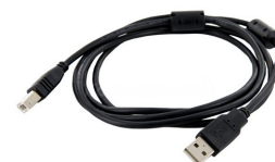
Typ A-B PT0238