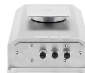
Easy access to the most functional interfaces